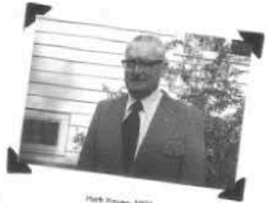
Herb House 1978